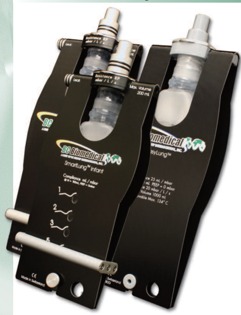
LS-2000A, LS-2000I, LS-1000E

BC Biomedical's Lung Simulator series is an affordable, ultra-portable and easy to maintain alternative to older models. The LS-2000(A/I) SmartLungs come in Adult and Infant models, offering all the performance and features of large and expensive test lungs in an easy to use, compact package. The LS-1000E EasyLung is a simple, low-cost, general purpose test lung with no variable controls.