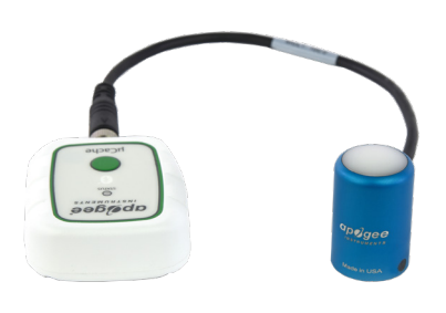
PQ-500 Full-spectrum Quantum

See our website for other available packages