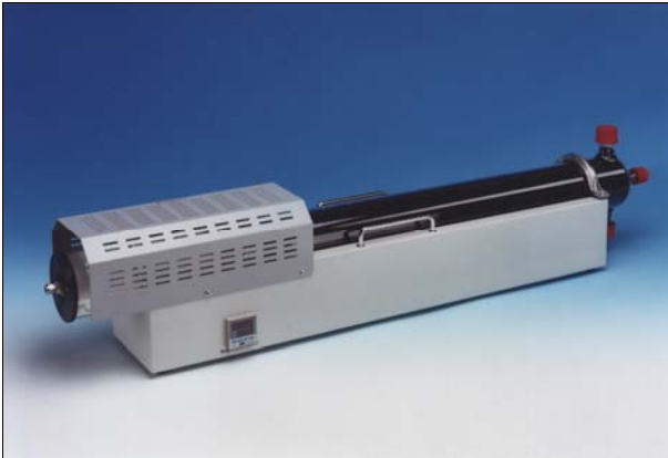
Thermodenuder TDD 590

The Model TDD 590 thermodenuder is designed to remove moisture and volatile particles from an aerosol sample for the subsequent measurement of dry particle size.