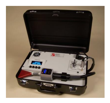
Photometer Model PH-4