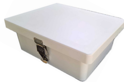
Ruggedized External Probe Enclosure Includes 50' C to C cable