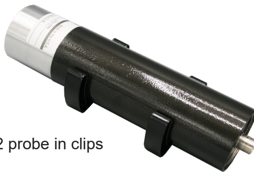
2x2 probe in clips