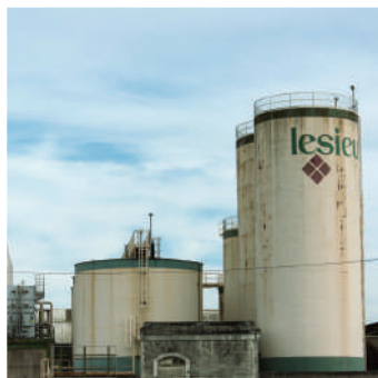
Oil & gas industry