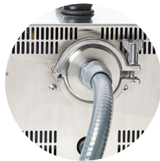
Hose Adaptor Connectors

The 6D can also be used for testing positive pressure systems using an optional positive injection pump (PIP) and hose adapter. On-site routine maintenance is easy. And its integrated compressor makes implementation simple - all you need is a power source.