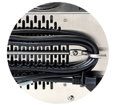
Power Cord Storage