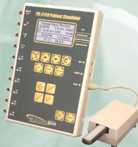
PS-2110 with MSP-2100 & FingerSim™

Wouldn't it be nice to have calibrated fingers?