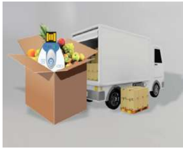
Put into the box / carton