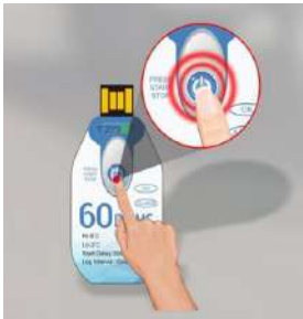
Press the button to start